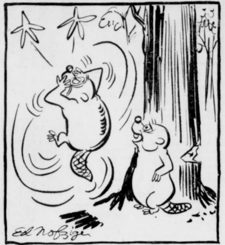
Forest Service, U. S. Department of Agriculture

"So you lost one tooth! Wait'll the farmer's new chain saw hit some of the nails that have been pounded into these trees."