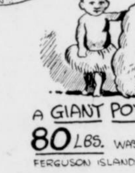
A GIANT POTATO WEIGHING 80 LBS. WAS RAISED ON FERGUSON ISLANDS SOUTH SEAS...

IN ALASKA, ONLY THE YOUNG MALE, BACHELOR SEALS ARE USED FOR THEIR PELTS!