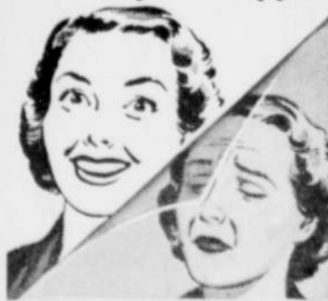
How Lydia Pinkham's works

And it should encourage you (if you're not taking Lydia Pinkham's) to see if your experience doesn't match theirs... to see if you, too, don't avoid