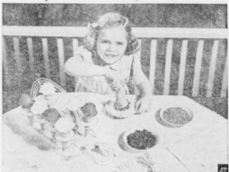
Your party will be the talk of the small-fry summer season if you trot out this novel dessert idea. Stand filled ice cream cones in a cold-drink glass holder as pictured. In addition, have three bowls—one filled with shredded coconut, one with chocolate chips, and one with grape-nuts. Then each child takes a cone, turns it upside down, and "dunks" it into the topping of his or her choice. A topping idea—in more ways than one! Kids will love it!