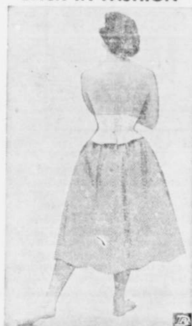
CHICAGO — Grandma's waist-pinchers and stiff taffeta petticoat stage a comeback this season in support of a new and shapely fashion silhouette. Here Marshall Field & Company reveals the "undercover" story of the small-waisted, full-skirted look of femininity that is high fashion this fall.