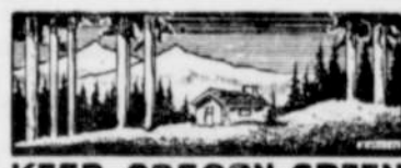
KEEP OREGON GREEN