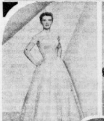
FOR SUMMER DANCES—This rustling taffeta with lace over-skirt has been selected as a dancing costume by Marion Marshall, Paramount star, soon to appear in "That's My Boy". The strapless scalloped bodice has smart removable sleeves.