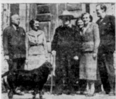
MARGARET VISITS CHURCHILL—Margaret Truman (right foreground), recently visited Winston Churchill at his home in Chartwell, Kent, England. Mr. Churchill is shown wearing a ten gallon hat and smoking a cigar.