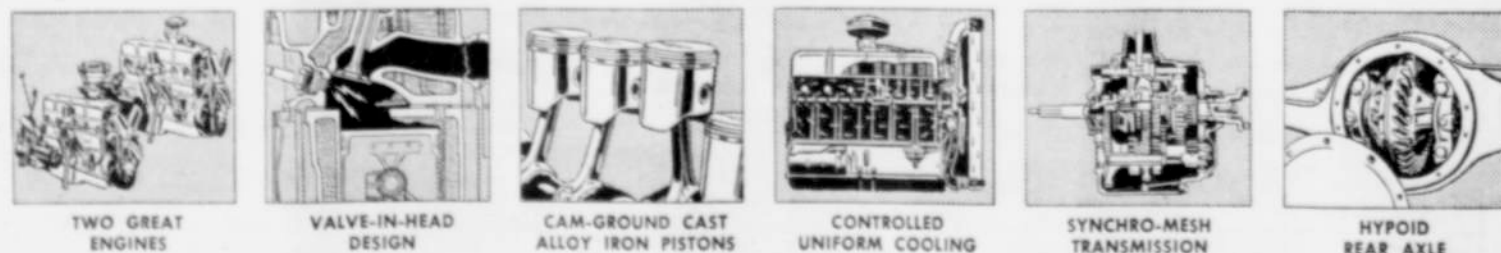
TWO GREAT ENGINES

More Chevrolet Trucks in Use Than Any Other Make!