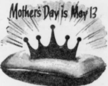
A Hallmark card's the crowning touch to warm mom's heart. To make Mother's Day truly memorable—choose from our new selection. Come in today.