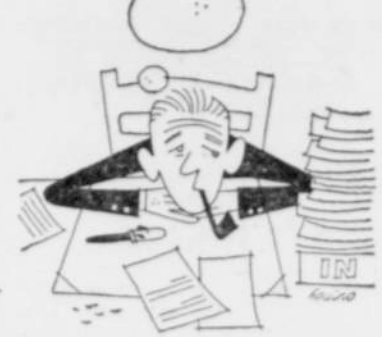
So by ten he was pooped He had mid-morning droops