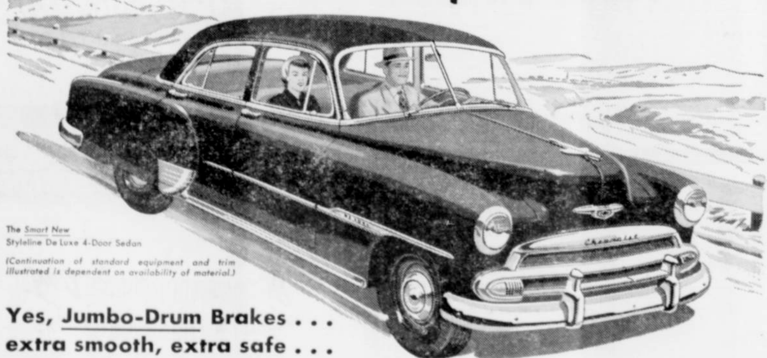
The Smart New Styleline De Luxe 4-Door Sedan (Continuation of standard equipment and trim illustrated is dependent on availability of material.)

Yes, Jumbo-Drum Brakes . . . extra smooth, extra safe . . .