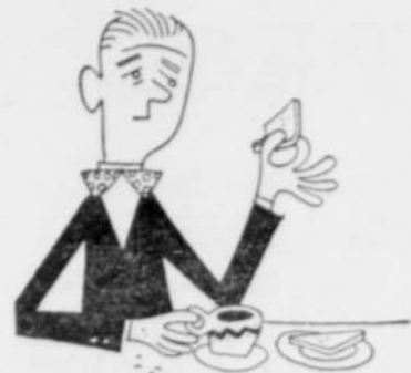
There was a young character Jerry Who skimpy-breakfasted in too much hurry