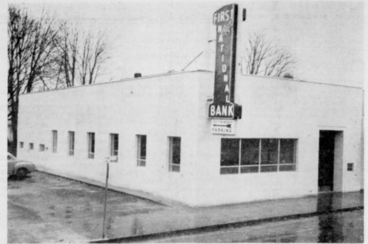
Santiam Valley citizens are pleased with the neat and modern appearance of the branch bank building newly erected for the First National Bank of Portland. A view of the new building is shown above.