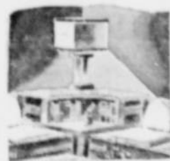
Table Lamps $5.95 up

Good Selection Beautiful CHROME DINETTE SETS