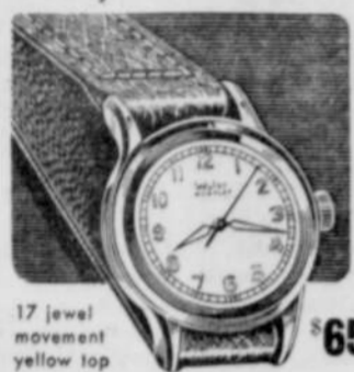
17 jewel movement yellow top $65