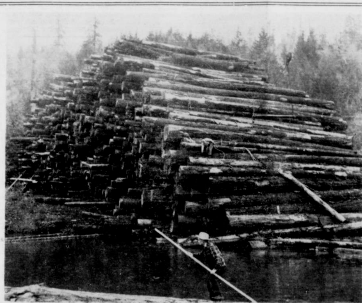
This huge pile of saw-logs is a "cold deck". This "cold deck" can be seen at the Freres-Frank mill west of Mill City. It contains approximately two and a quarter million board feet of lumber. These piled-up logs have been brought down to the Freres-Frank mill from the Detroit dam reservoir clearing project above Mill City. Arlo Tuers, superintendent of the mill, estimates that the logs in the picture will provide saw material for some four months' operation. Shown is a pile of logs some 60 feet high and 300 feet long. The man on the "cold deck" is "rigging" a log for its trip into the pond. The man in the foreground is riding a log—"poling it"—to the mill for sawing into lumber.