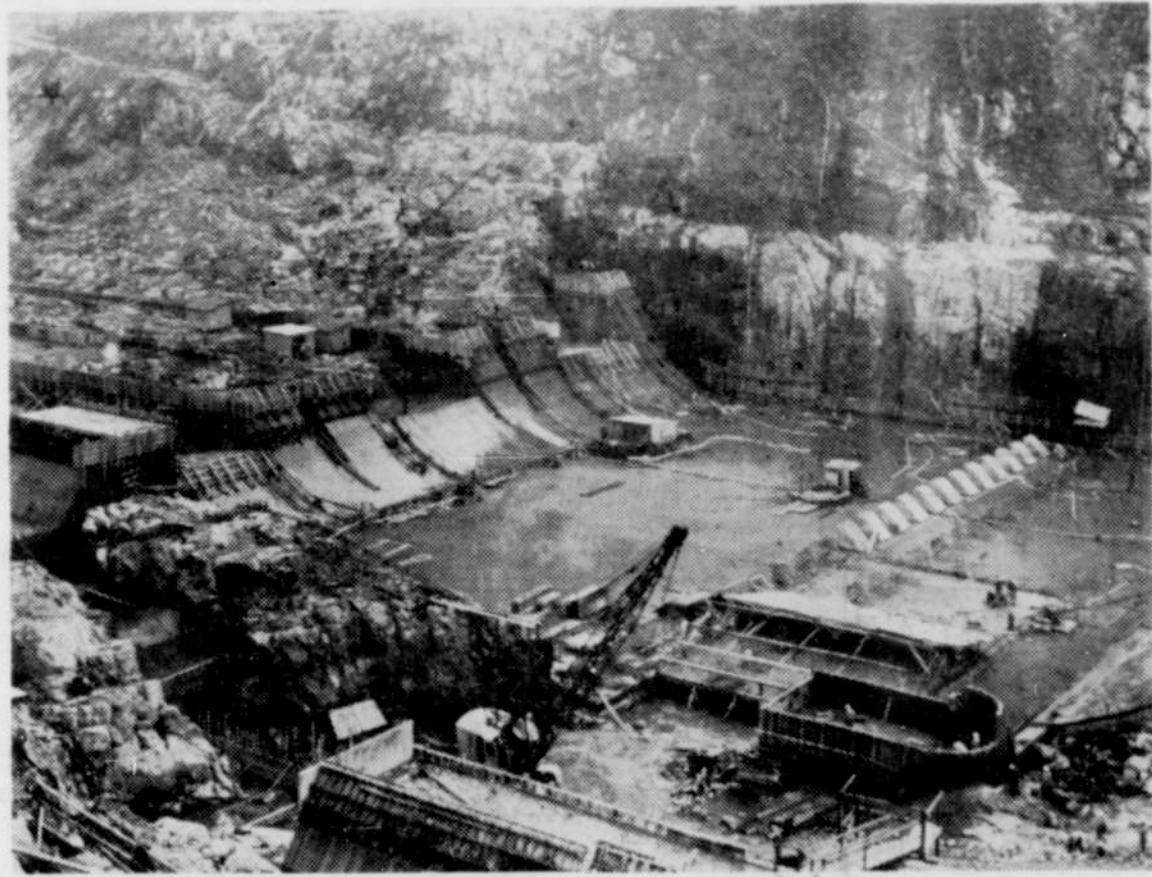
Above is a "before" scene of the Detroit Dam project. This close-up of the Detroit Dam spillway area shows the magnitude of the area and workings covered by the recently flooded North Santiam river as pictured below. The heavy equipment shown in the picture was moved to safety out of the reach of the flood.