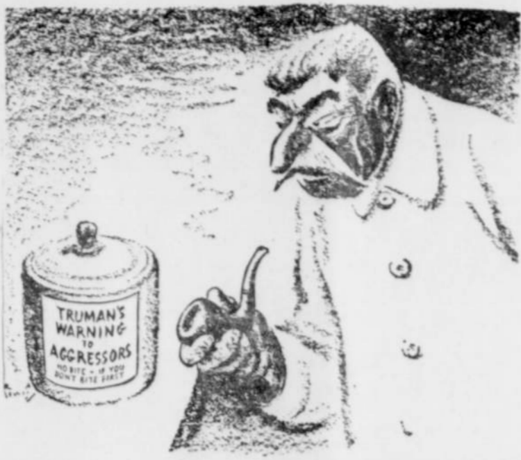
Reprinted from the "Milwaukee Journal"