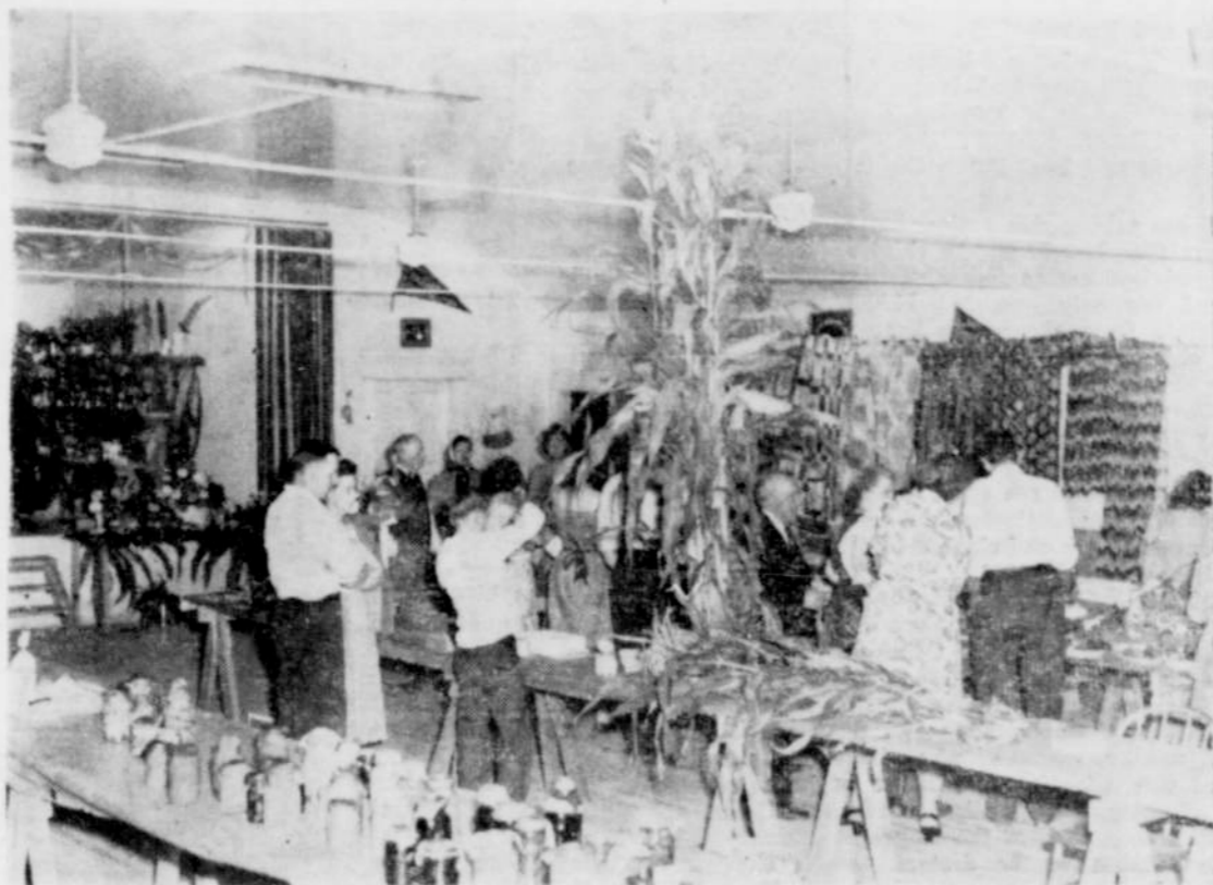
LYONS—The large corn stalks shown here were only a small part of the many attractions here when the Santiam Valley Grange staged its annual fall festival. The photo, taken in the Grange hall shows a few of the hundreds who attended the festival looking over the outstanding exhibits.