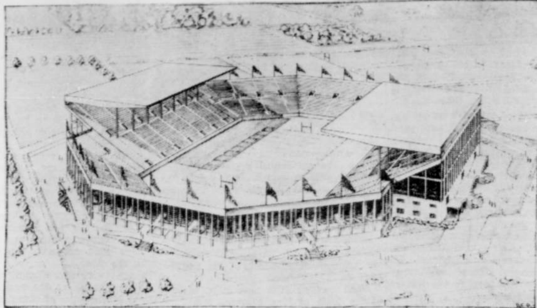
Architect's drawing of proposed new football stadium at Oregon State college for which alumni have launched a statewide gift campaign. Sketch shows completed stadium with 62,000 seating capacity, though first objective is two side stands, one covered, with bleachers at the ends, giving an initial capacity of 35,000. Present wooden Bell field stadium has scant 20,000 capacity and is beyond the stage where rebuilding is feasible, engineers have informed college officials.