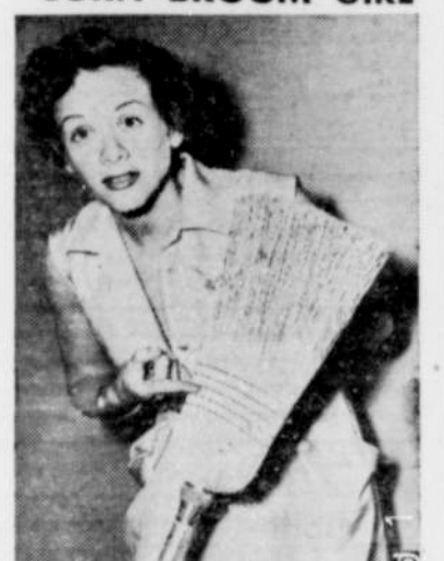
Fran Warren, Singing Star

Texas Guinan used to greet visitors to her famous night club by shouting "Hello Sucker" at them as they entered. The folks who wine and dined in her saloon—oops, salon—could afford to be suckers. Can you—when you go to market to buy a broom?