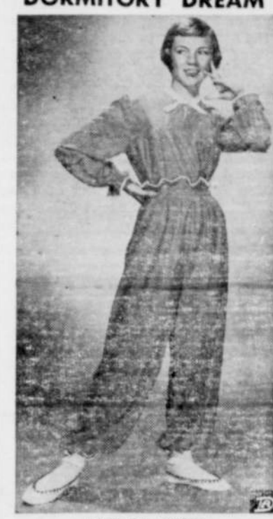
AND SO COZY

Pajamas bright as pennants are fashion news this fall. An example the gay note soon to be seen in girls' dormitories is this Luxite pierrot pajama, available in excitng colors of red, blue, pink and jonquil, with contrasting trim. Of fluffknit brushed rayon, the tuck-it. plouse is caught in a trouser petal-ruffle, with additional flares at wrists and ankles.