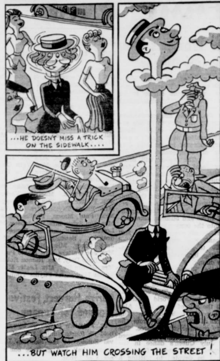
Trovers Safety Service