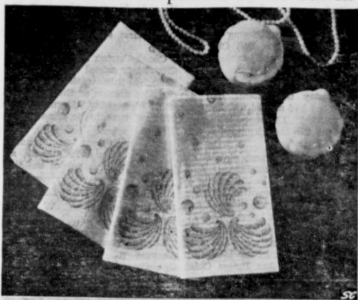
The effect of cool sea breezes is brought into the bathroom this summer by the new "Shells" design of the Masslinn disposable fabric guest hand towels. Made of non-woven rayon and cotton, they come in light and dark shrimp pink, and sapphire blue. Style-coordinated by Dorothy Draper, famed decorator, the new towels have the textured softness and absorbency of linen, and the convenience of paper. No laundry problem here!