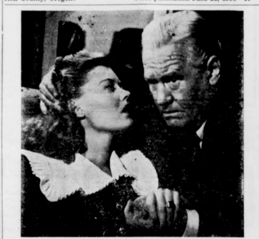
Startling secrets she couldn't even reveal to her mother are finally told to her family doctor by Marcia Mae Jones, the feminine star, in the movie "Street Corner" The enlightening movie plays at the Mill City Theatre four times on Friday, July 7. Showings for men only will be at 10:30 a.m. and 9 p.m., for women only at 2 and 7 p.m.

STATE TIMBER SALE Notice is hereby given that oral bids will be received by the State Forester or his authorized agent, acting in behalf of the State of Oregon by and through its Board of Forestry, at 2600 State Street, Salem, Oregon, at 9:00 o'clock A.M., daylight saving time, July 24, 1950, for 1,339 MBF old growth Douglas fir, 409 MBF second growth Douglas fir, and 50 MBF western hemlock, more or less, designated for cutting by the State Forester or his agent upon the following described land located in Marion County, Oregon: