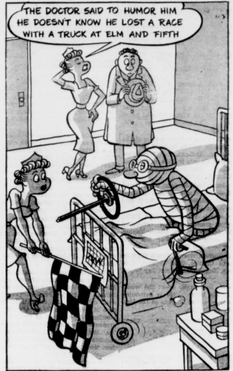
Trunkers Safety Service