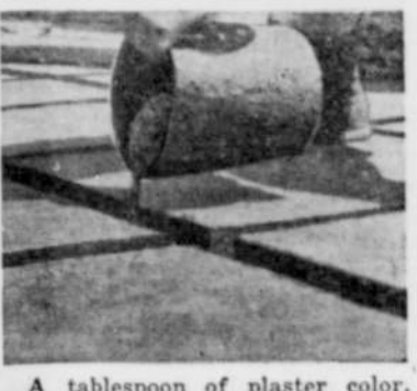
A tablespoon of plaster color, prinkled on each square is troweled into concrete surface (left).

When form is set, (above) renove frames and pour mortar into