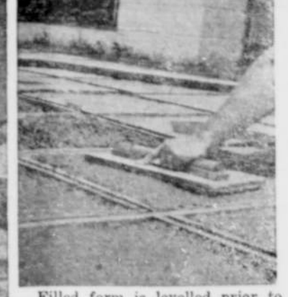
Filled form is levelled prior applying colored topping.