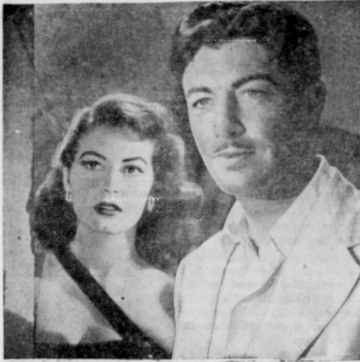
A dramatic situation confronts Robert Taylor and Ava Gardner in "The Bribe" at the Mill City Theatre, Tues., Wed., Dec. 20-21.

gon Department of Veterans Affairs. The war claims act provides payment of one dollar for each day a U. S. armed forces member was subjected to malnutrition while held in an enemy prisoner of war camp during World War II.