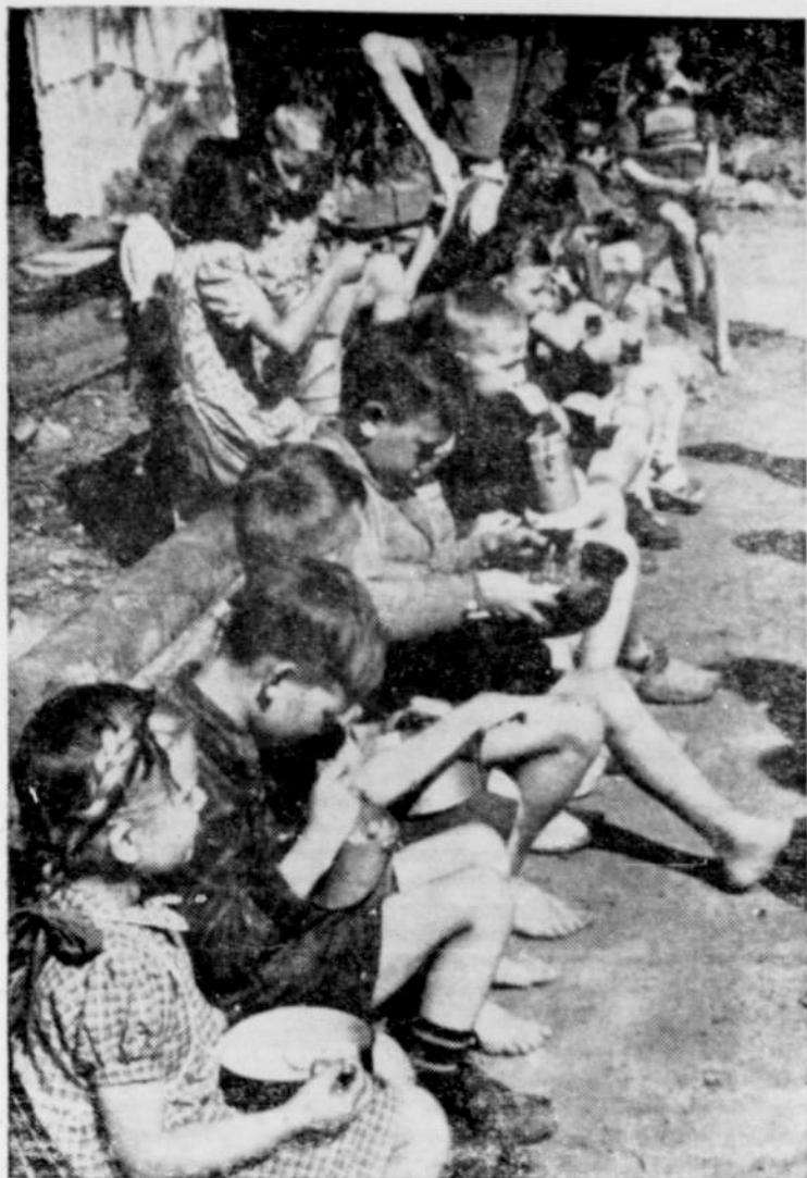
Hungry children such as these in Rechtenbach, Germany, will benefit from bulk farm commodities given to the Christian Rural Overseas Program (CROP) by Oregon farmers during the next few days. CROP hopes to raise between 12 and 14 carloads of commodities in Oregon for shipment overseas. Volunteer CROP workers are currently making a door-to-door solicitation of Oregon farmers.