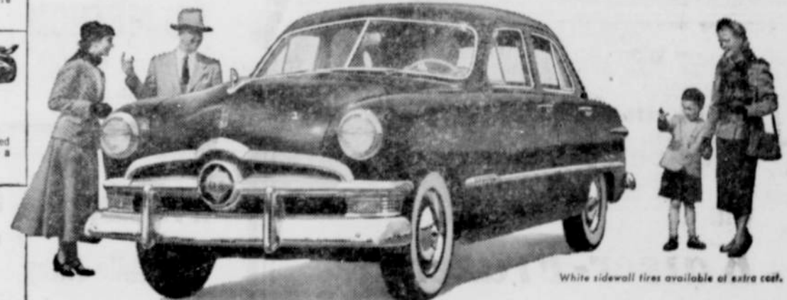
White sidewall tires available at extra cost.

The 1950 Ford is 50 ways new and finer... from new heavier gauge steel frame and 13 way stronger "Lifeguard" body to new designed ceiling and seating for greater head room. New comfortable foam rubber front seat cushions, over new special non-