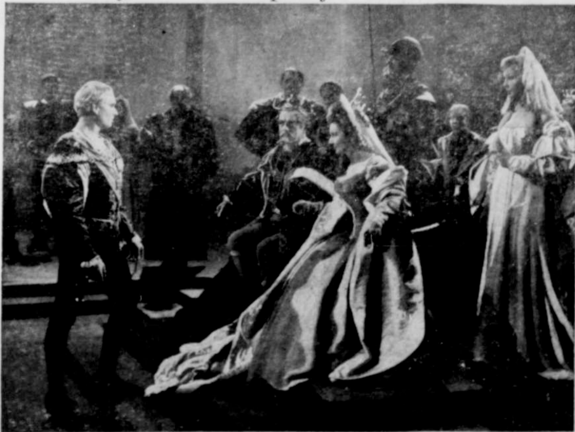
Laurence Olivier confronts Basil Sydney and Eileen Herlie, while Jean Simmons looks on, as the dramatic "play-within-a-play" scene of "Hamlet" begins, in the Olivier production of Shakespeare's great tragedy now at the . . . Theatre.