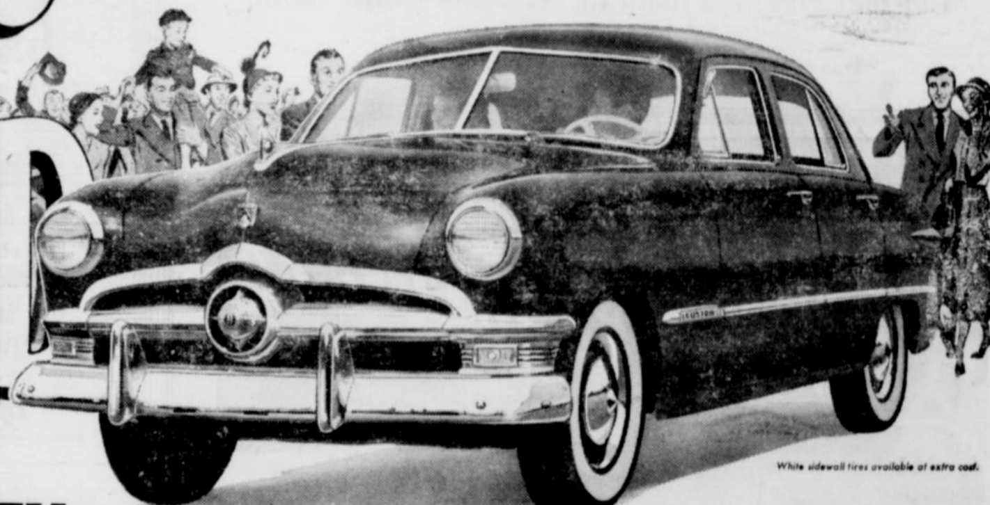
White sidewall tires available at extra cost.