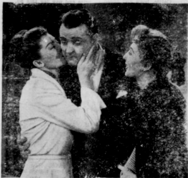
Scene from "Neptune's Daughter", film coming to Mill City Theater