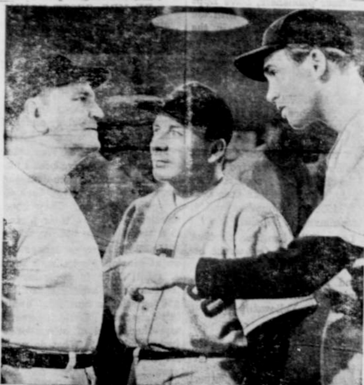
SCENE from "The Stratton Story," a drama of the great heroism of a Chicago White Sox pitcher who went back to win games after losing a leg in a hunting accident.