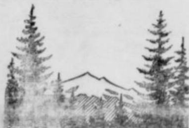
"Keep Oregon Green"

The victory guts Mill City as a major challenger for top honors in the Marion County B League.