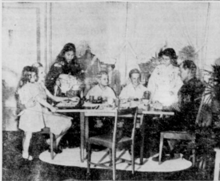
Two Japanese housegirls are shown serving breakfast to a Navy chief petty officer and his family in Japan. There is no talk about the high cost of living among the more than one hundred Navy families at the Headquarters of the Commander, Fleet Activities, Yokosuka. For twenty-seven dollars a month they occupy from five to seven rooms furnished complete with electric ranges, telephones, refrigerators and houseboys. Features of the Navy community, known as the Griffin Park Housing Area, include schools, a modern department store, a well-stocked commissary and a beauty salon.