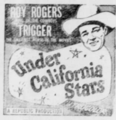
Sunday and Monday

FOUNDATION GARMENTS Special Attention Given to Fittings Hosiery-Lingerie-Dresses-Smocks 131 High St. Salem Ph. 4032