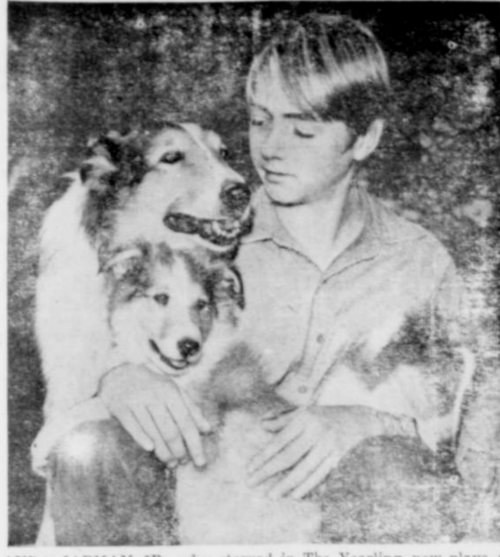
CLAUDE JARMAN JR., who starred in The Yearling, now plays an appealing role in "The Sun Comes Up" at the Mill City Theatre Sunday and Monday. With him, above, is Lassie, a star herself.