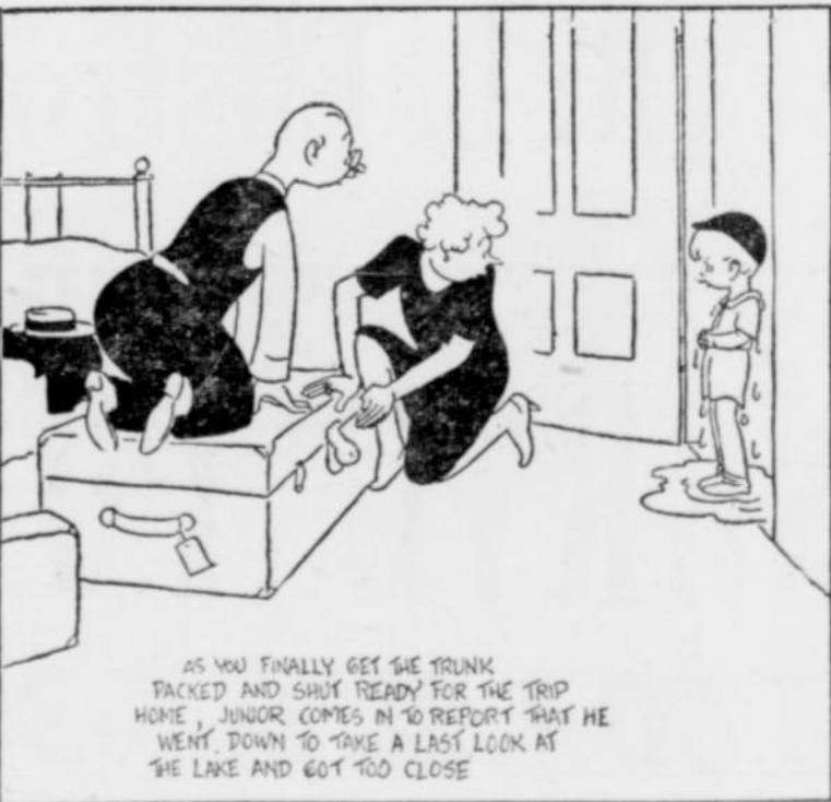
AS YOU FINALLY GET THE TRUNK PACKED AND SHUT READY FOR THE TRIP HOME, JUNIOR COMES IN TO REPORT THAT HE WENT DOWN TO TAKE A LAST LOOK AT THE LAKE AND GOT TOO CLOSE