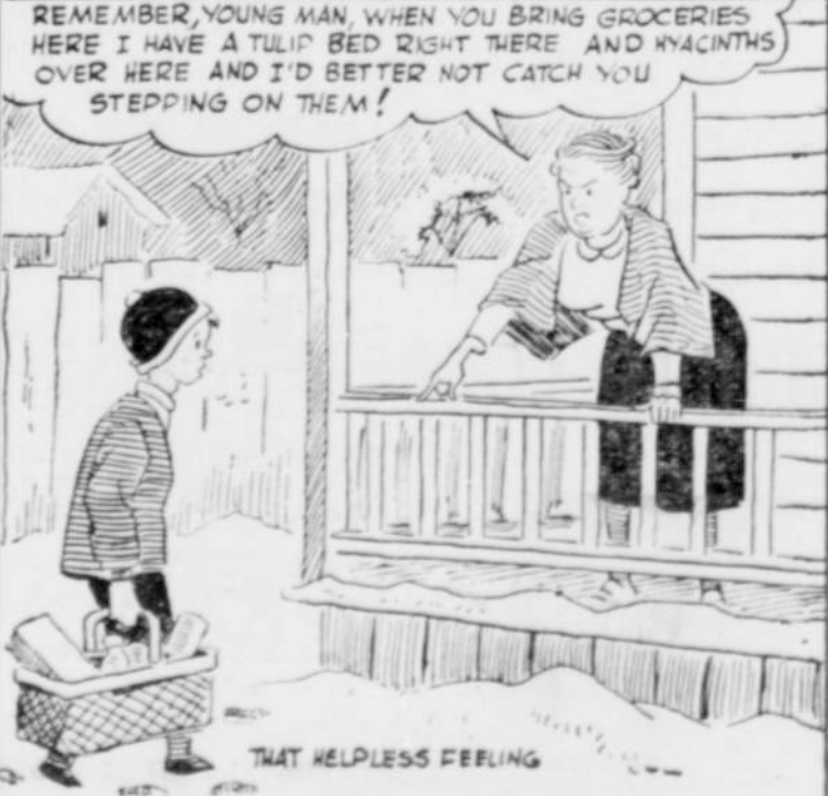
REMEMBER, YOUNG MAN, WHEN YOU BRING GROCERIES HERE I HAVE A TULIP BED RIGHT THERE AND YACINTHS OVER HERE AND I'D BETTER NOT CATCH YOU STEPPING ON THEM!