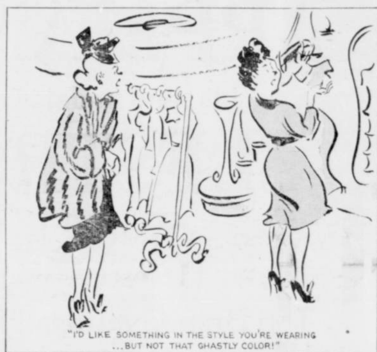
"I'D LIKE SOMETHING IN THE STYLE YOU'RE WEARING... BUT NOT THAT GHASTLY COLOR!"