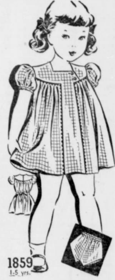
1859 1.5 yrs.