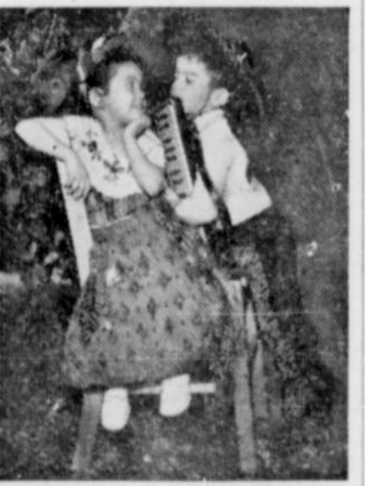
Chicago Museum of Science and Industry.

For their Christmas Eve singing the 12 Brethren are dressed in dark clothes and black silk top hats. As the name of Christ is mentioned in their song, they uncover their heads.