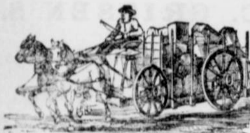
No. 1 CITY TRUCK.

A Washington correspondent mentions the fact that, with the exception of the administrations of Fillmore and Pierce, during which the heads of departments were not changed at all, no cabinet since President Van Buren's has remained so long without alteration as that of President Cleveland. The New York Star thinks "this speaks volumes for the harmony and efficiency of the cabinet and for the happy interdependence between the secretaries and the chief of state." It is also a matter of fact, is it not, that no cabinet has ever remained intact under so strong a pressure for a breach as has the cabinet of President Cleveland.