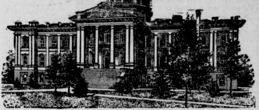
CAPITOL BUILDING, SALEM, OREGON.

Uses Pe-ru-na in His Family For Colds and Grip.