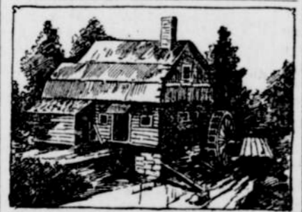
MILL IS A CENTURY OLD.

In the northern part of Morrow County, Ohio, there is a mill a century old. It is an old-fashioned water-power