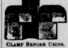
CLAMP BEFORE USING.