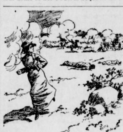
DASHES THROUGH THE FIRING LINE.

When they left them carelessly about, and these she forwarded to the enemy. She was suspected after a time, and then one of her notes fell into the Federal hands and she was arrested, reprimanded and threatened, but Gen. Shields set her at liberty. Gen. Shields, she said afterward, was completely off his guard and introduced her to officers of his staff.