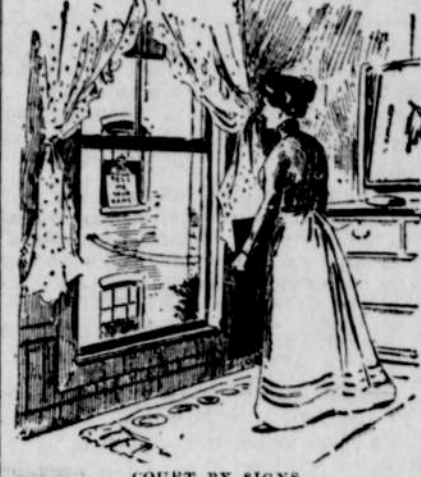
COURT BY SIGNS.

One day a young woman employed in one of the department stores and a young man holding a clerkship in a music store engaged rooms on Shaw-