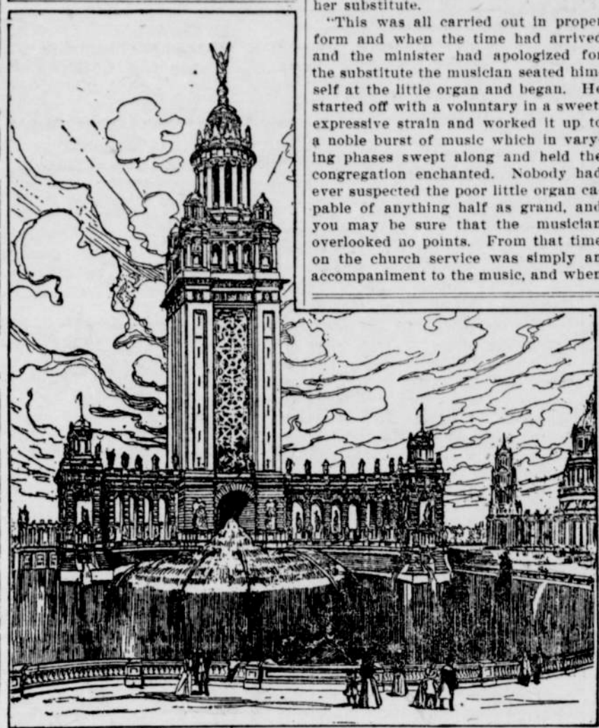
THE ELECTRIC TOWER.

348 feet above the basin in which it stands. It is planted on the east and west by long curved colonnades, which sweep to the southward and terminate in airy pavilions, forming a semi-circular space 200 feet across. Within this space and in a high niche in the main body of the tower are cascades, while all about the basin are leaping jets and countless playful fountains, each with its spurt of water, combining to make a brilliant water scene. At the center of the niche is a tall geyser fountain, whose waters find their way from the high basin within the niche over successive ledges and among a multitude of vases to the level of the pool.