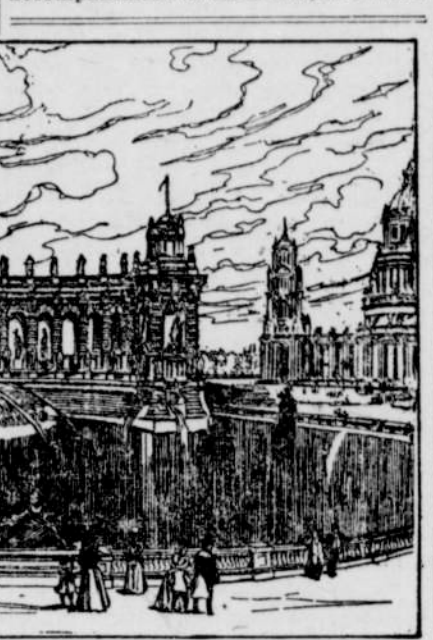
THE ELECTRIC TOWER.

"This was all carried out in proper form and when the time had arrived and the minister had apologized for the substitute the musician seated himself at the little organ and began. He started off with a voluntary in a sweet, expressive strain and worked it up to a noble burst of music which in varying phases swept along and held the congregation enchanted. Nobody had ever suspected the poor little organ capable of anything half as grand, and you may be sure that the musician overlooked no points. From that time on the church service was simply an accompaniment to the music, and when