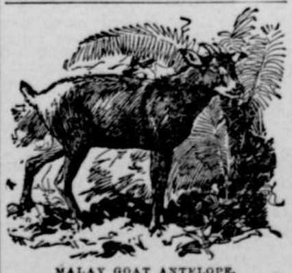
MALAY GOAT ANTELOPE.

But everybody signified a willingness to accept the captain's word unsupported by further evidence and the next man on the story-telling list started in.—Philadelphia Inquirer.