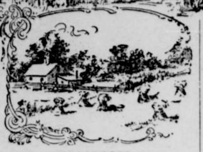
LOADING LIVE STOCK.

The accompanying illustration shows a device for loading hogs and sheep that are too heavy to lift. The figure represents one side only. The bottom is a two-inch plank one foot or sixteen inches wide, or as wide as the wagon box, if you want it, with slats nailed crosswise on the bottom to keep the stock from slipping. The ends are both of the same angle so that when set up on the hind end of the wagon it will fit the box, and the end on the ground is perpendicular. By means of a few portable panels we can load stock almost any place where there is a fence for one side. The device can be adjusted to suit the wagon, unlike one that is stationary. We have scales, and a breeding pen for pigs, and it comes handy to unload sows, and at the scales for loading fat hogs and sheep.—A. S. Forsman, in Ohio Farmer.