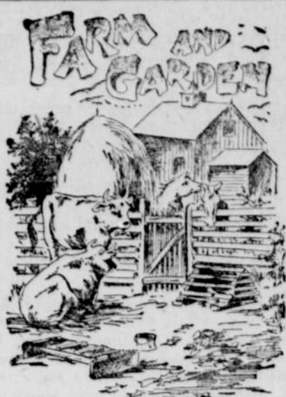
FARM AND GARDEN

Never experiment with so important an article as the human food