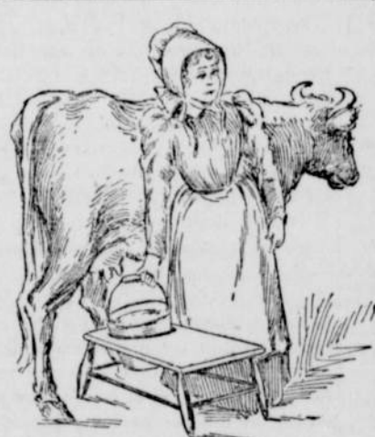
MILKING STOOL AND PAIL HOLDER.

The Modern Milking 'foot. The cow cannot kick over the milk pail when this invention is used, says an exchange. Besides offering a security for the milk it also affords a seat for the milker. The idea, which is clearly shown in the cut, consists of an ordinary oblong four-legged bench of sufficient size to permit an opening in its top to receive the bucket. This opening has slanting walls, so as to