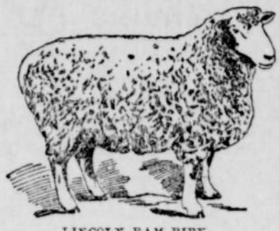
LINCOLN RAM BIRDY.

Recently this sheep has come into the forefront as an improver of the native flocks of Australia and South America, the half-bred mutton making the finest shipping mutton for the English markets. The ram whose portrait is given was purchased from the leading flock in Lincolnshire, England, for the sum of one thousand pounds sterling, an amazing figure for something over three hundred pounds of mutton. But the animal was unquestionably worth it, for its destination is to more than double the value of thousands of the poor sheep of Argentina, and to add