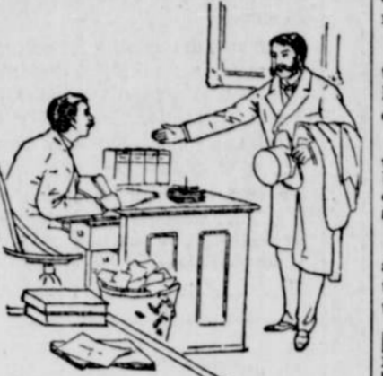
I Want to Swear to That.