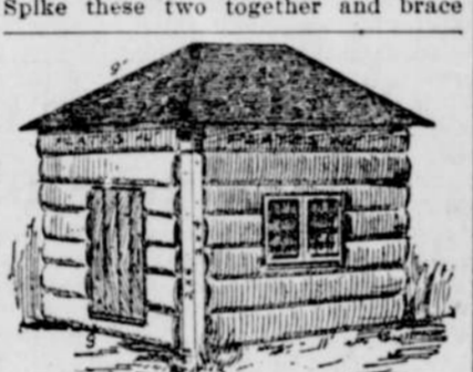
SUBSTANTIAL POULTRY HOUSE.

Here is the plan of chicken coop built of logs. First lay the sill logs and toenail on the corners, making the logs 2 by 4 by 8 feet and 2 by 6 by 8 feet. Spike these two together and brace