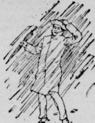
In all Sorts of Weather.

He suffered for over 30 years, and the last decade has suffered so much that he was unable to do any work. To this the frequent occurrences of dizzy spells were added, making him almost a helpless invalid.