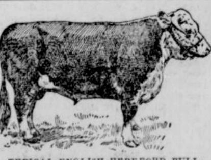
TYPICAL ENGLISH HEREFORD BULL.

In color, the Hereford is a red of varying shade, generally light, with clear white face, white line of greater or less length along the back, white brisket, white brush and white feet. The horns are medium to long, white, waxy and generally turning outward, forward, and sometimes downward. In form they are blocky, square built, with rather short legs, and all meat points full and rounded. The quarters are heavy, muscular and low down on the